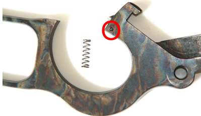
New Lever Detent Spring

Using a 1/16" punch, drive out pin holding lever detent assembly. Replace old spring with new one and reinstall pin. Reassemble bolt and lever from first step.